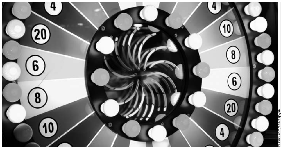
Wheel of fortune as a pricing anchor almost always works...

In the first test 4 out of 5 people chose the premium beer option (at £2.50) and produced £236 for every 100 buyers.